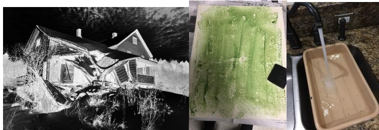
Fig. 11-13 Isidro G Pentzke Process of Loss , 2016 11 Digital print 12 chemical 13 chemical baths

After I photographed the work, I entered it into my digital program and started the process of making the digital negative, knowing that within this process I would lose some information. Then I took my negative through the process of exposing it and going through the chemical baths. (Fig.11-13)