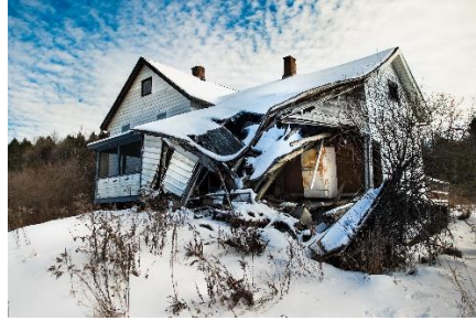
Fig. 10 Isidro G Pentzke Process of Loss , 2017 Digital print

After I photographed the work, I entered it into my digital program and started the process of making the digital negative, knowing that within this process I would lose some information. Then I took my negative through the process of exposing it and going through the chemical baths. (Fig.11-13)