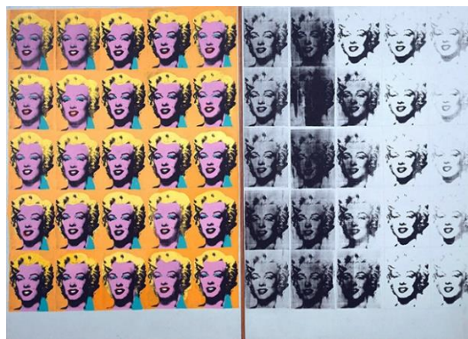
Fig. 1 Andy Warhol, Marilyn Diptych, 1962, acrylic on canvas, 2054 x 1448 mm

One of Warhol's more notable works of art is Marilyn Diptych, (Fig.1) This work showcased a reproduction of an iconic person that was massively consumed by the public. Warhol, being a populist artist, was known for making art that the masses found appealing.