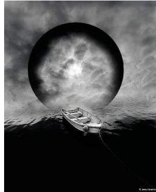
Fig. 9 Jerry Uelsmann's Untitled (Boat and Moon), 1982 gelatin silver print signed and titled 1x14

In my research, I have discovered some important points that have greatly blended with my topic of digital disconnection. This topic of digital disconnection is experienced differently by everyone. It is this distinct difference by the individual's and their interpretations of my work that will keep my work from being viewed the same each time it is experienced or viewed, yet, the overall message will be the same. It is my belief, that an image's power comes from the ability to invest or transport oneself from a viewer to an explorer of his or her own understanding of the topic.