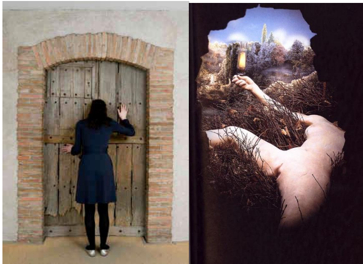
15-16 Marcel Duchamp 1946–1966 Sculpture Size Unknown

portal. Where only the viewer is privileged to the art that is displayed inside. (Fig.15-16)