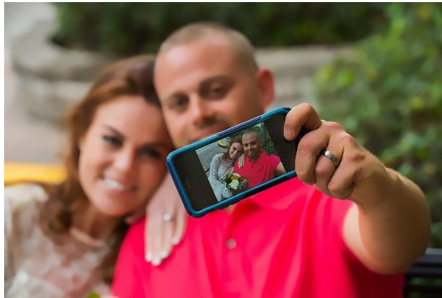
Fig. 17 Isidro G Pentzke Process of Loss , 2017 Digital print

This idea that of an alternate reality brought me to move my work from my traditional tactile image to images that were only accessible in a cyber world. To do this I still needed images of this disconnection. So, I went out and photographed and videoed people that were completely engrossed in technology. (Fig. 17)